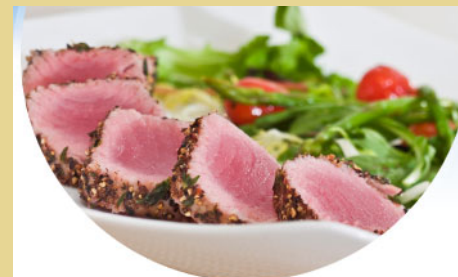
Albacore Tuna Loin #21700-1/10 lb.