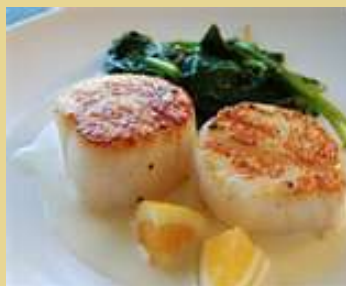
Scallop Pieces #21515-1/8 lb.